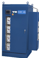
Robust, durable air-conditioned control cabinet (optional PLC operator interface is available).

All controls are available as an engineered system design to control key functions of the UV Rim coating and curing application. Power supplies slide into an air-conditioned cabinet for easy-access, space savings, and efficient installation. The power supply controls provide fully-integrated operation and monitoring of the lamps, complete power selection, and necessary safety interlocking.