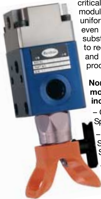
Airless spray module.