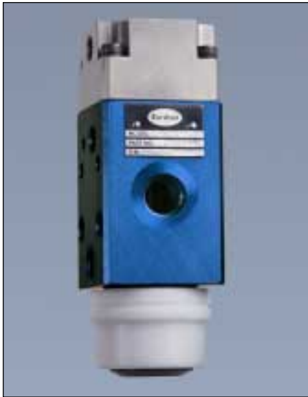
Air spray module.

Applying adhesives and sealants with spray equipment provides non-contact dispensing and rapid