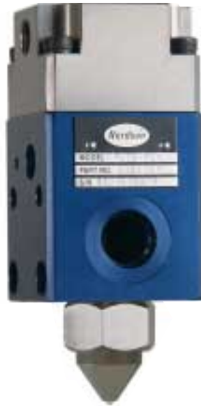
Zero cavity module.

Nordson zero cavity guns provide accurate deposition and flow control for applications requiring clog-free operation, sharp cut-off and uniform bead patterns. Zero cavity guns feature a close-tolerance matched needle-and-seat assembly that eliminates the formation of minute